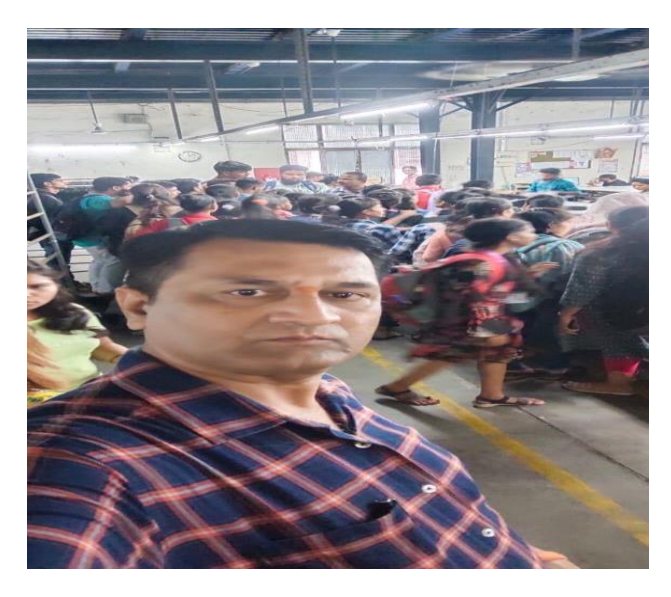
Students with faculty members during visit